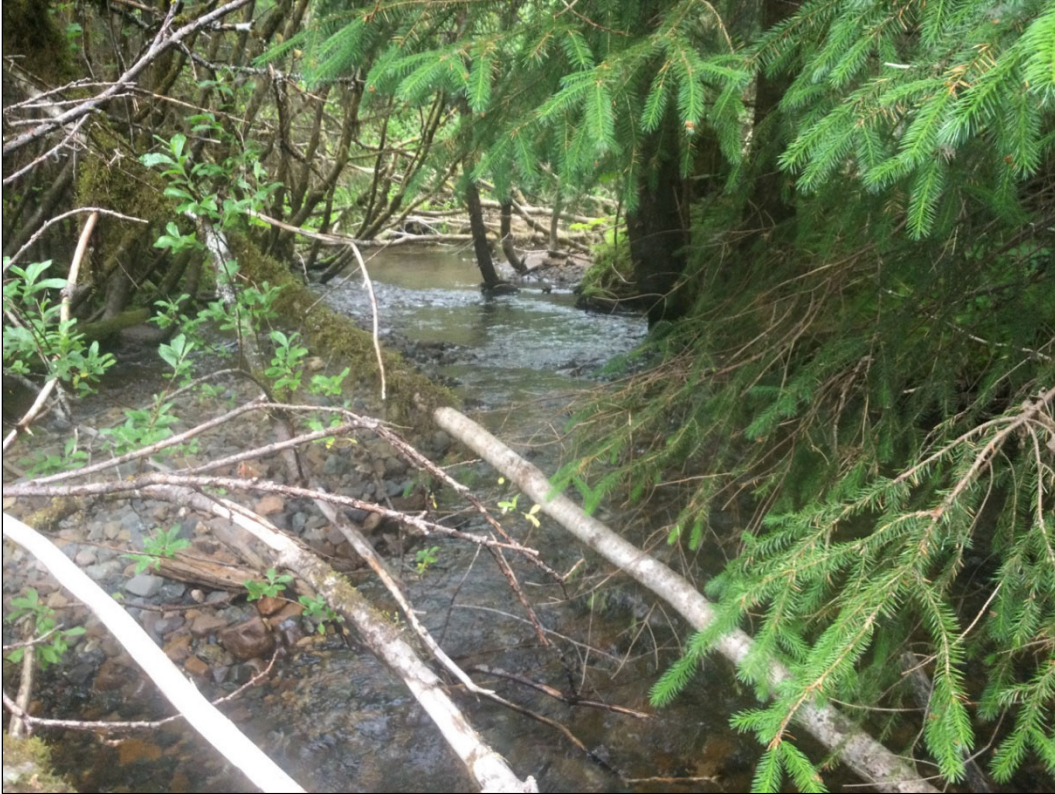
Figure 1.—Channel at waypoint 946.