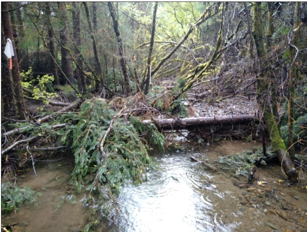
Figure 4.—Channel at waypoint 900.