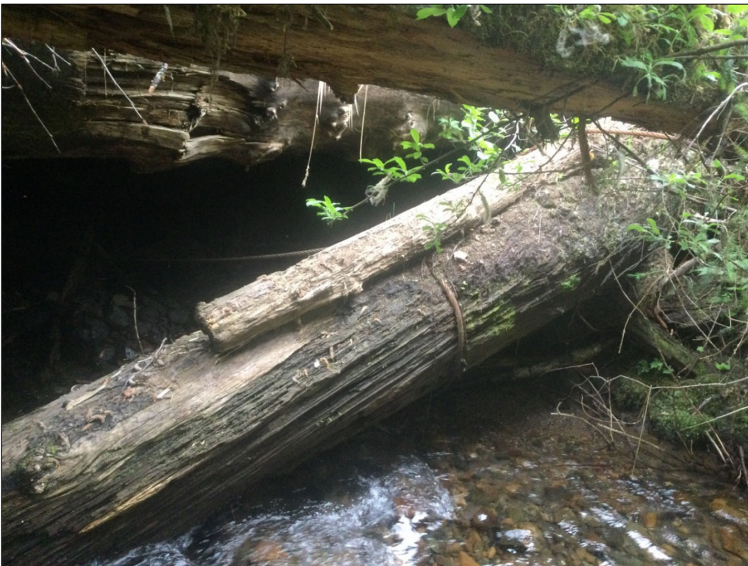
Figure 2.—Bridge with collapsed log at waypoint 946.