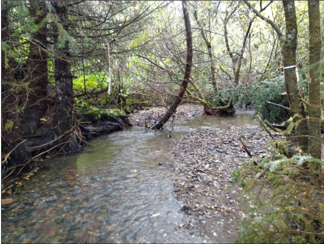
Figure 3.—Channel at waypoint 903.